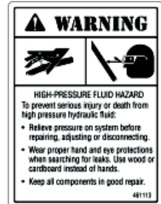
B. WARNING - High pressure Fluid Hazard Sign Number 461113