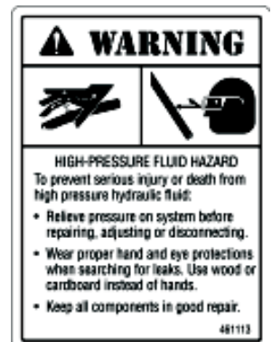
B. WARNING - High Pressure Fluid Hazard. Sign Number 461113.