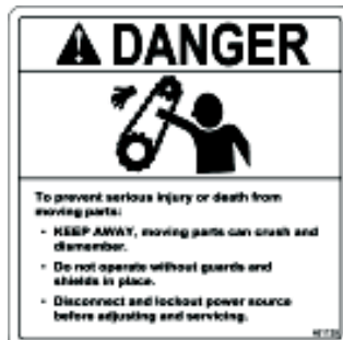
C. DANGER - Do Not Operate without Guards. Sign Number 461139.