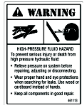
B. WARNING - High pressure Fluid Hazard Sign Number 461113