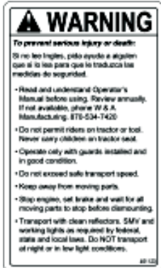
A. WARNING - Operator's Manual Sign Number 461123