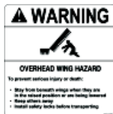
E. WARNING - Overhead Wing Hazard Sign Number 461135

F. Amber Reflectors - Also located at both front ends of center section and at front ends of wings. Total of six required. Sign Number 461200.