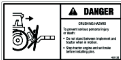
C. DANGER - Crushing Hazard Sign Number 461138