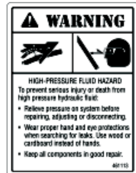
B. WARNING - High pressure Fluid Hazard Sign Number 461113