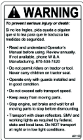
C. WARNING - Operator's Manual Sign Number 461123

N/I Yellow Reflector. Sign Number 461200. Two required. One at each end of front side of reel frame.