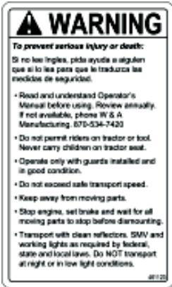
A. WARNING - Operator's Manual Sign Number 461123