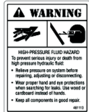
B. WARNING - High pressure Fluid Hazard Sign Number 461113